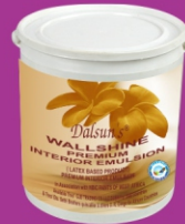
Wallshine Premium Interior Emulsion