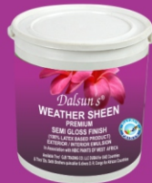
Weather Sheen Premium Emulsion