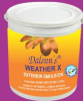
Weather - X Emulsion