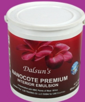
Nanocote Interior Emulsion