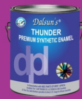
Thunder Premium Synthetic Enamel